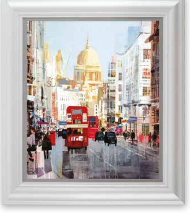
Tom Butler Like Clockwork Paper on Board Edition of 195 Artwork Size: 15 x 18" Framed Size: 27 x 27"