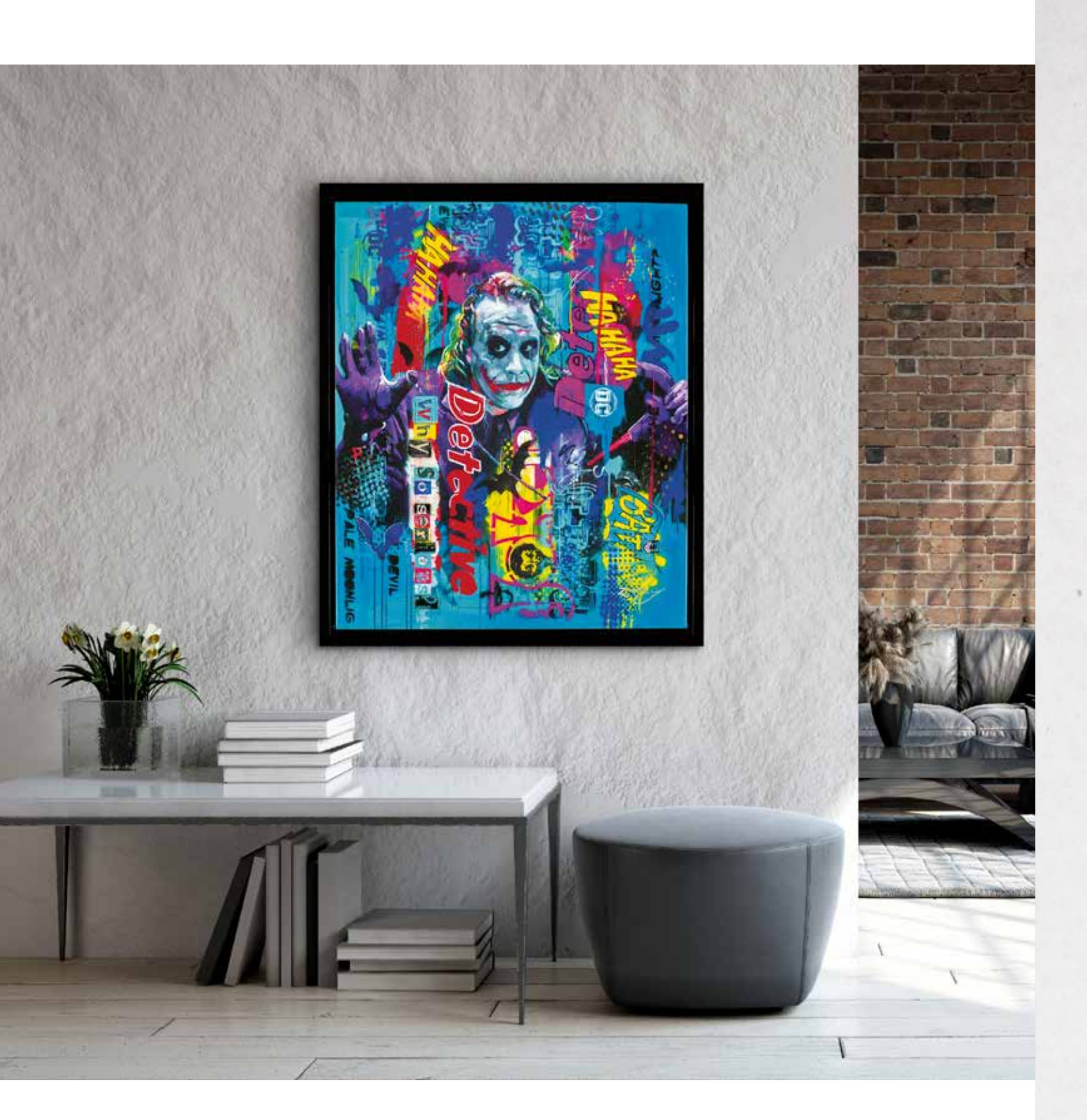
Zinsky Why so Serious? Glazed Paper on Board Edition of 150 Artwork Size: 28 x 31" Framed Size: 33 x 36"